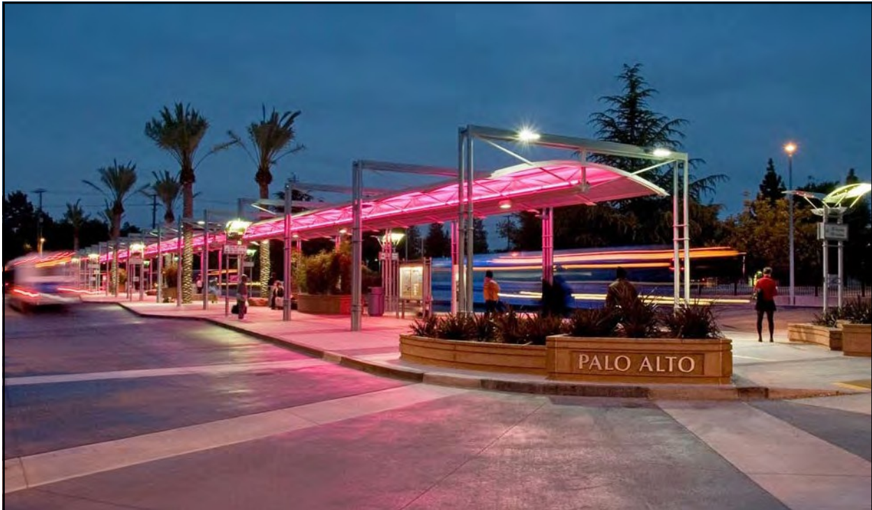
Palo Alto, California

Owner: Santa Clara Valley Transportation Authority