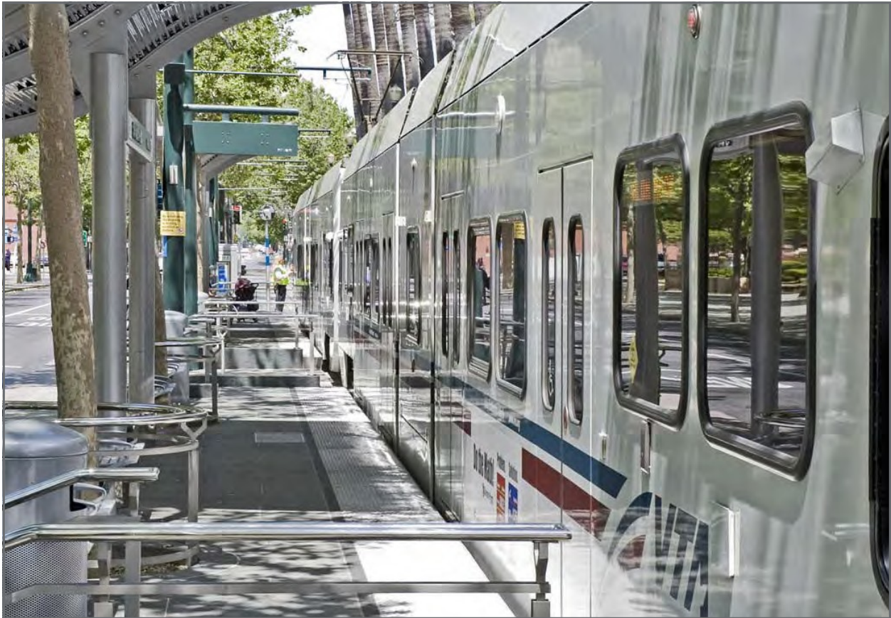
San Jose, California

Owner: Santa Clara Valley Transportation Authority